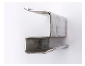
RESIDENTIAL "A" SERIES

For doors up to 3100mm wide. Features our unique "Safe-Edge" design.